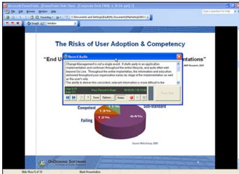
Record and synchronize narration while in your presentation